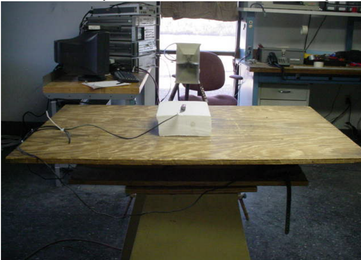
Figure 3 - Power, Spurious & Other > 1 GHz Measurements