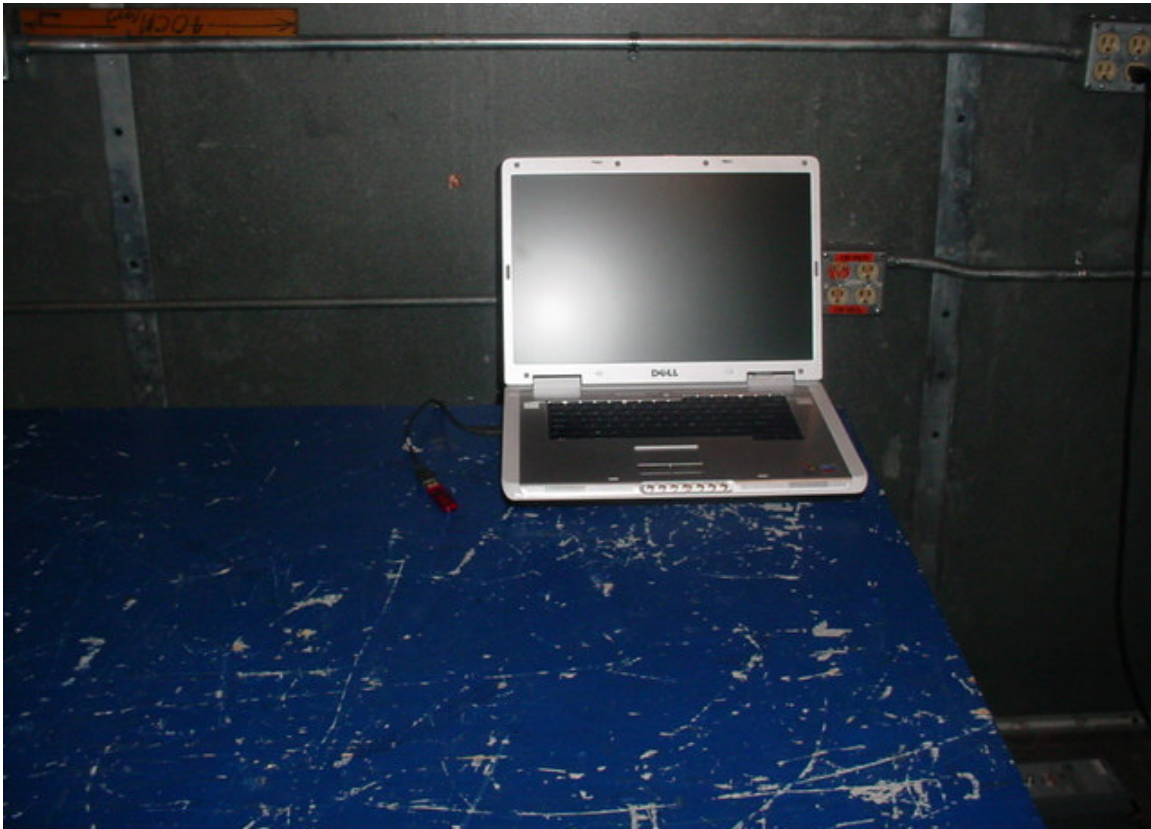
Figure 1 - Mains Conducted Emission