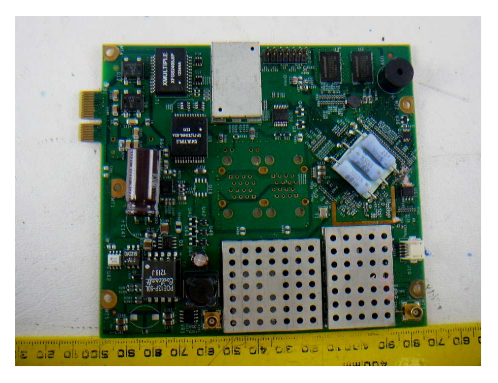
17.2 EUT – Main Board Bottom View