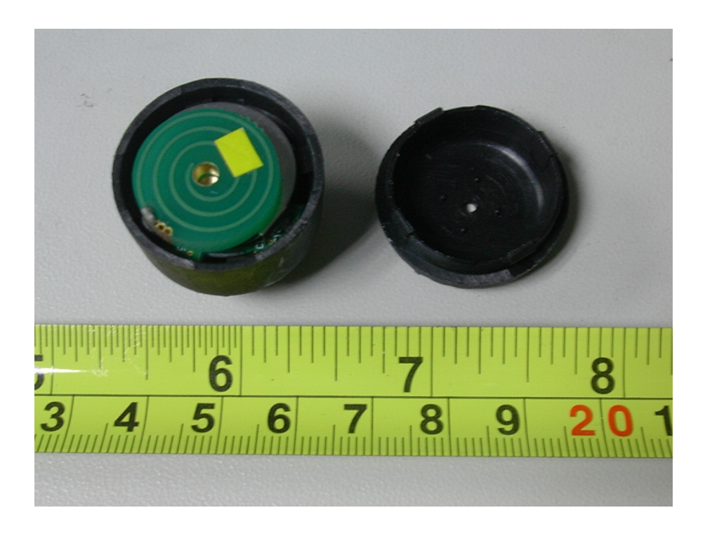
Solder Board-Component View 1