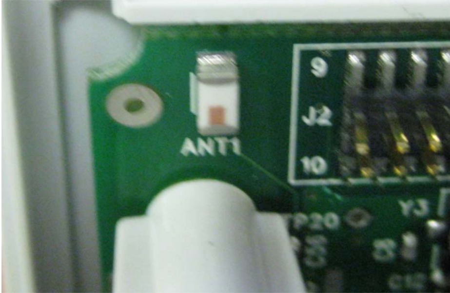
Close up of chip antenna