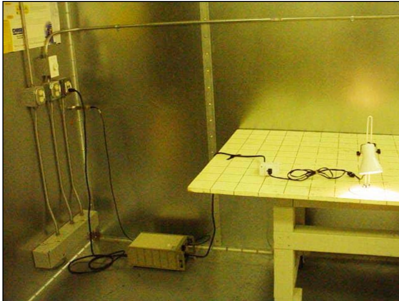
View of the EUT (“Appliance Monitor” shown) setup during emissions measurements conducted onto AC mains.