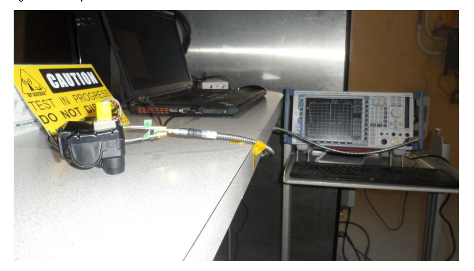
Figure E21.3 – Setup Photo – Conducted Measurements