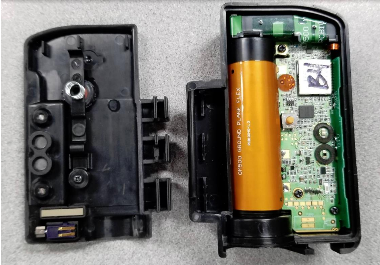
Figure E20.1 – Internal Photo – Clam Shelled