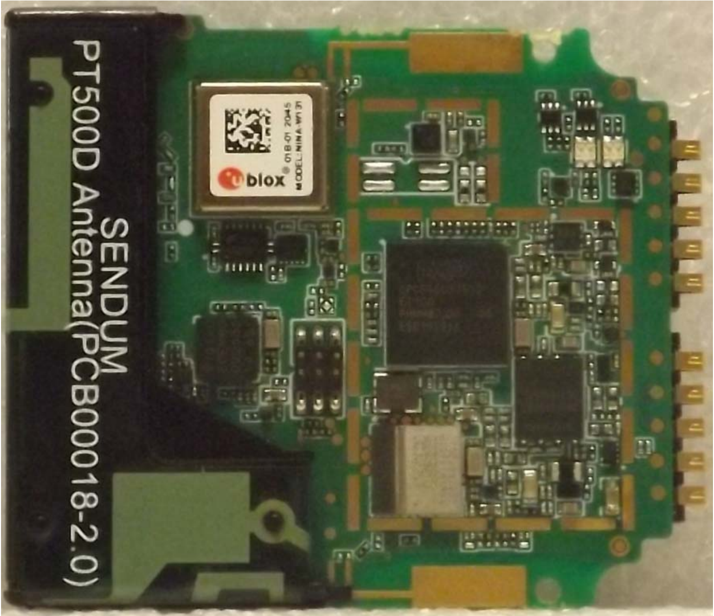
Figure E22.1 – Internal – PCB Top