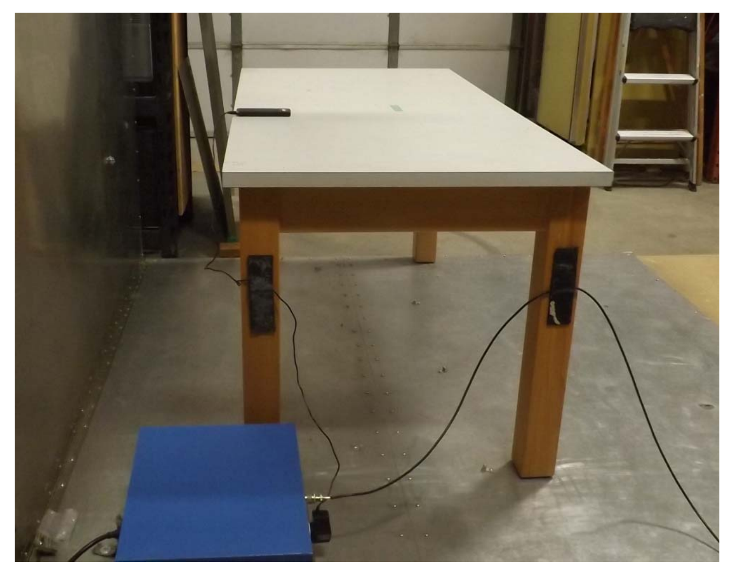
Figure E23.2 – Setup – AC Line Conducted