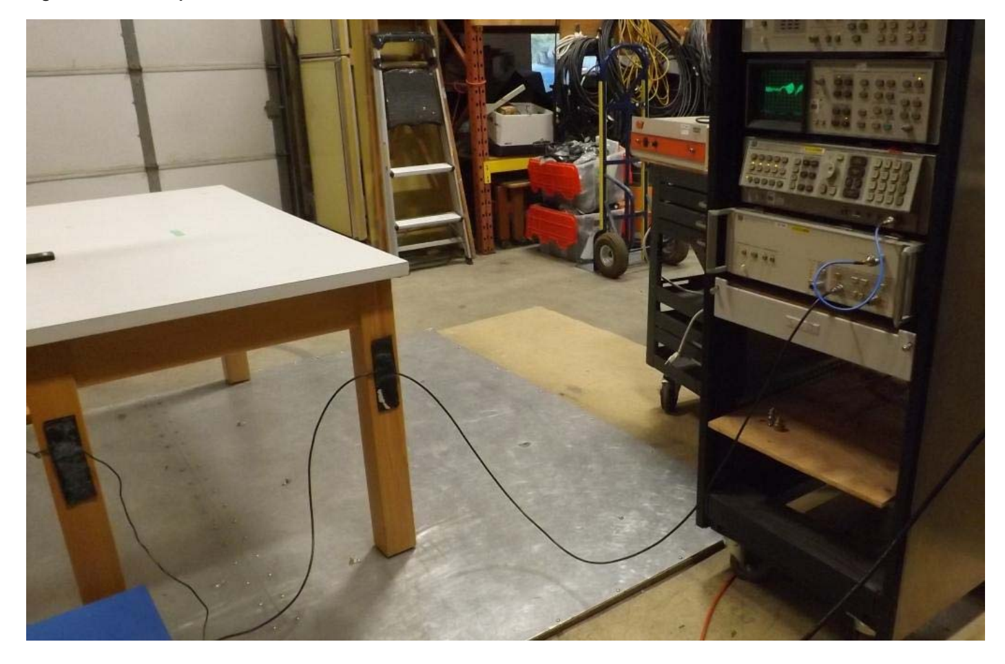
Figure E23.4 – Setup – AC Line Conducted