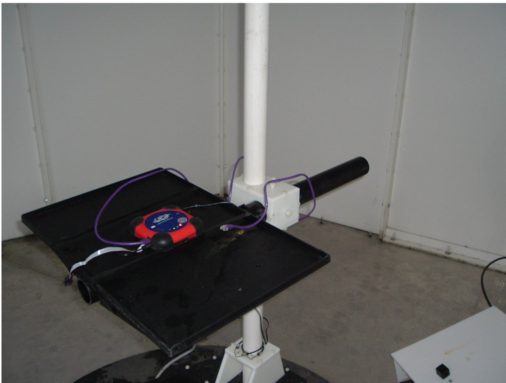
Radiated emissions test setup