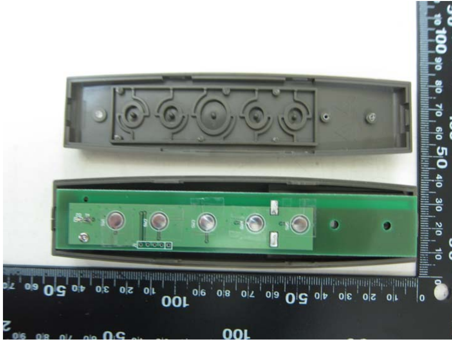
Inside View of the EUT