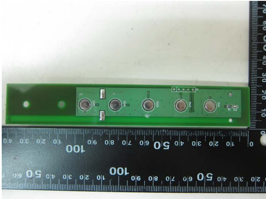
Rear View of the PCB