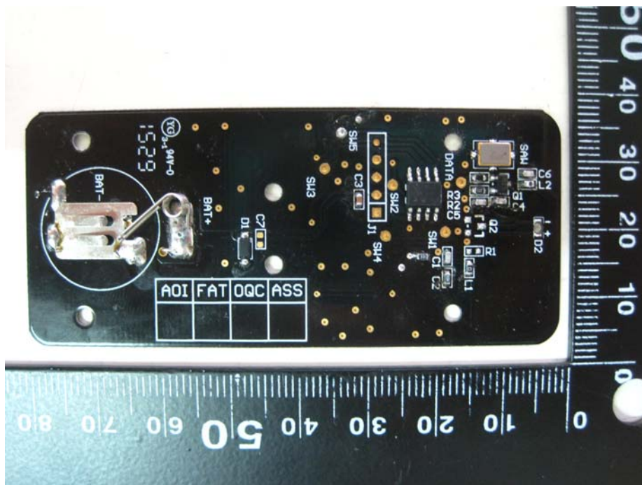
Front View of the PCB