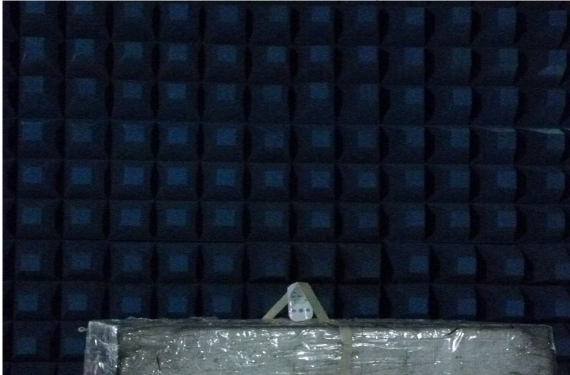
Bandwidth measurement Setup Photo