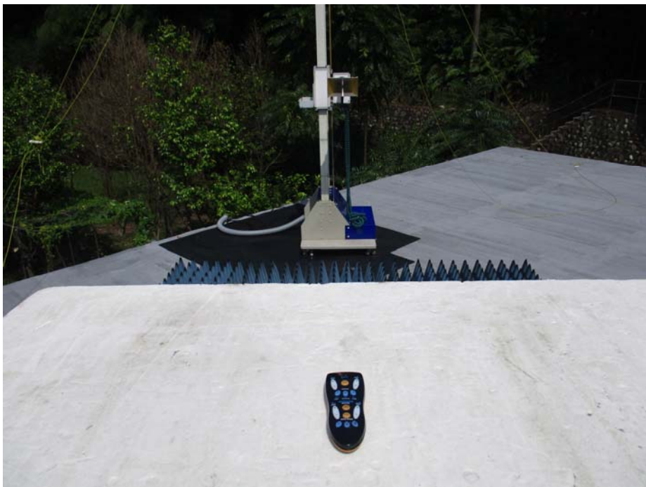
Above 1 GHz