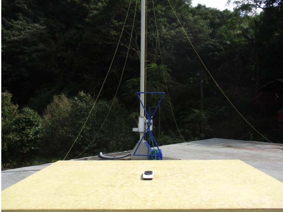
Below 1 GHz (The height of testing table is 0.8m)