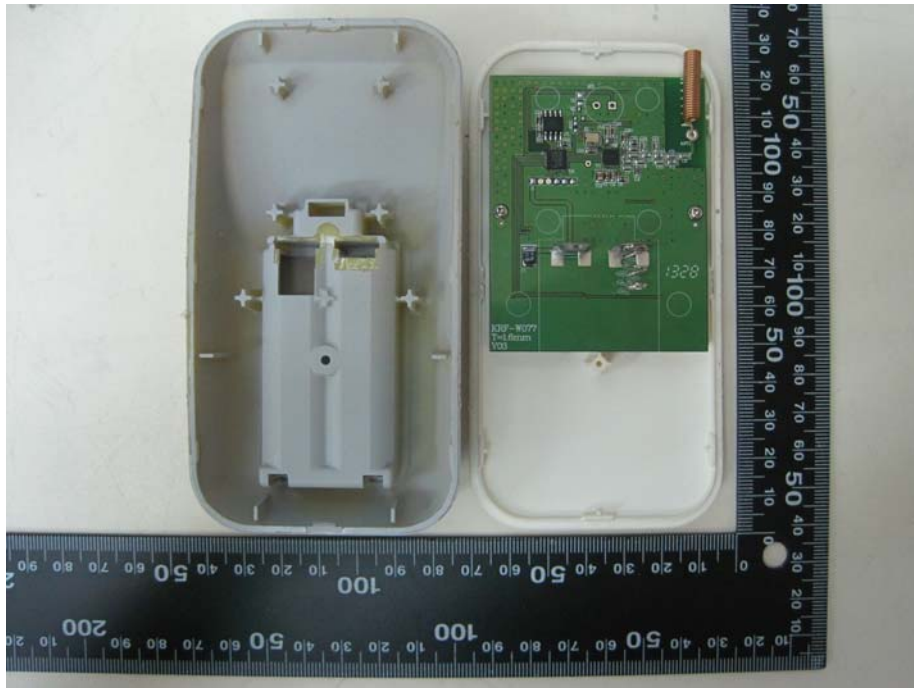
Inside View of the EUT