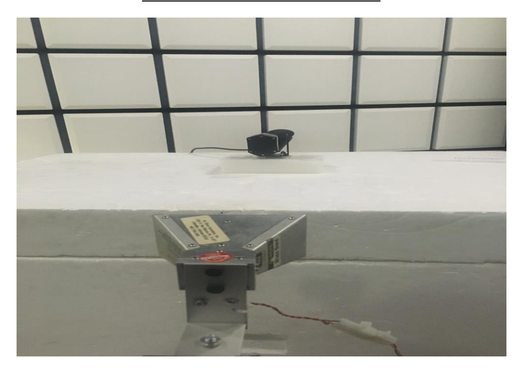
Radiated measurement from 33-50 GHz