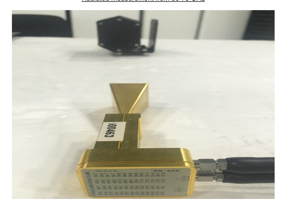
Radiated measurement from 75-110 GHz