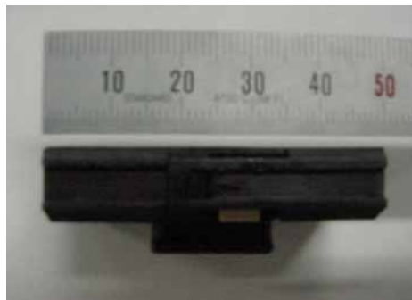
Side View -A