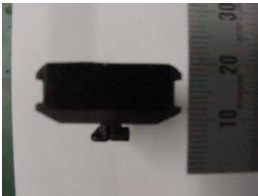
Side View -C