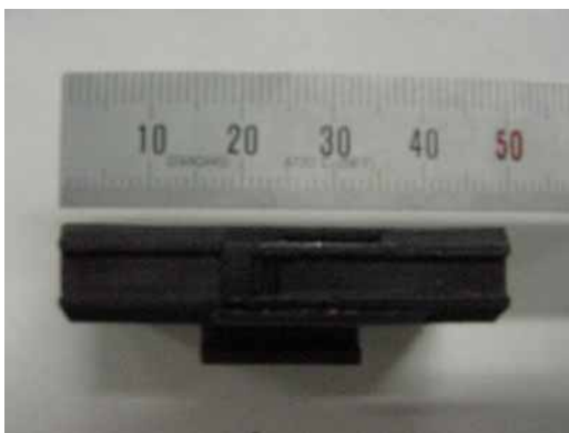
Side View -C