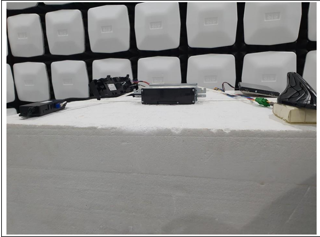
EUT Position: X-axis