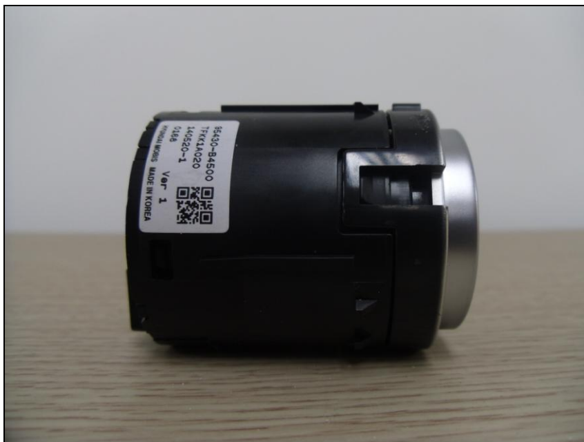
Rear view of EUT