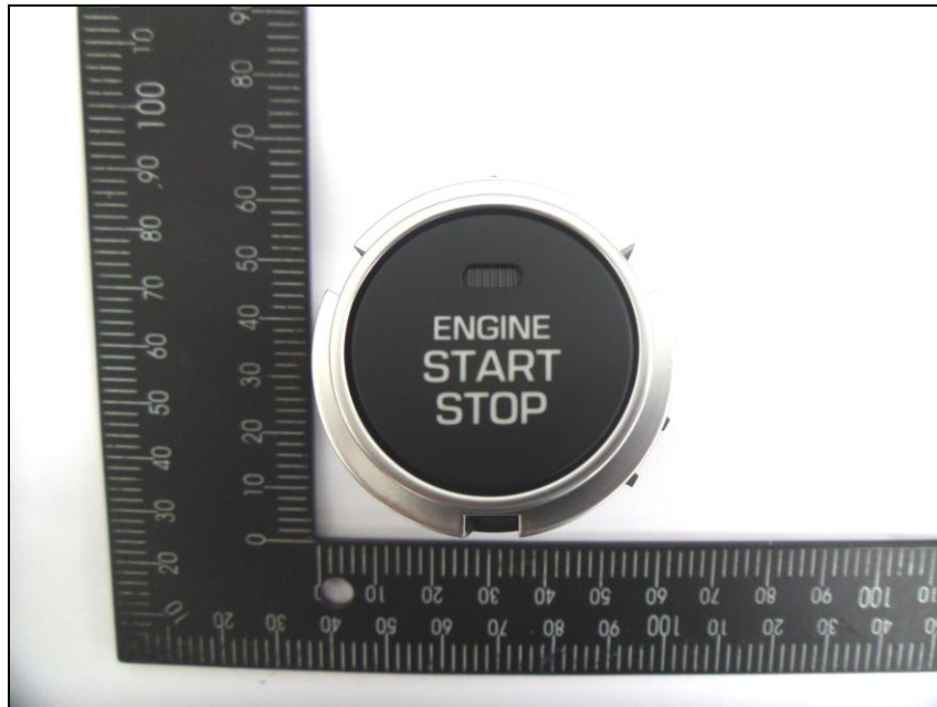
Bottom view of EUT