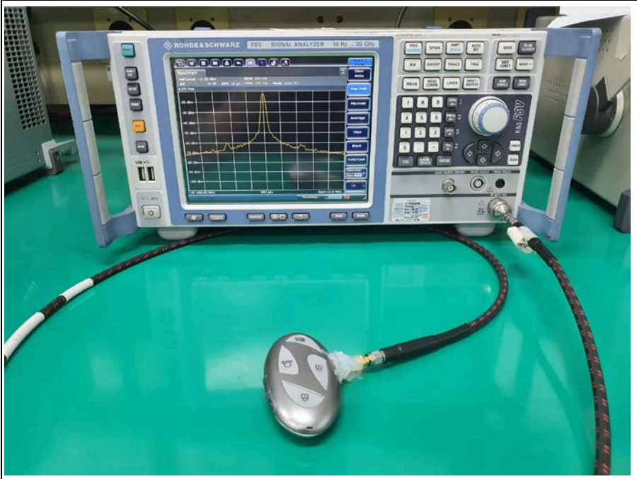
Model name: FOB-4F61M43