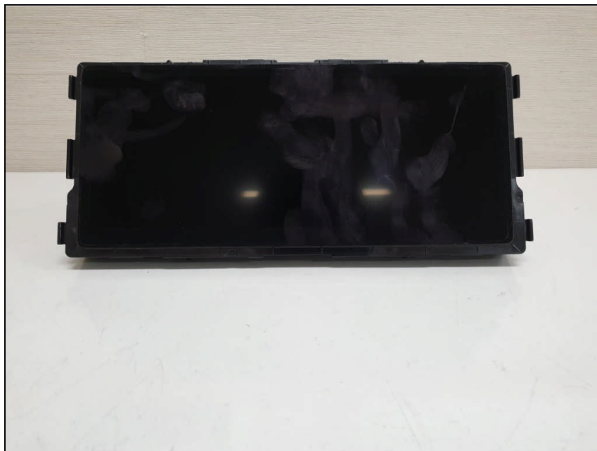
Rear view of EUT