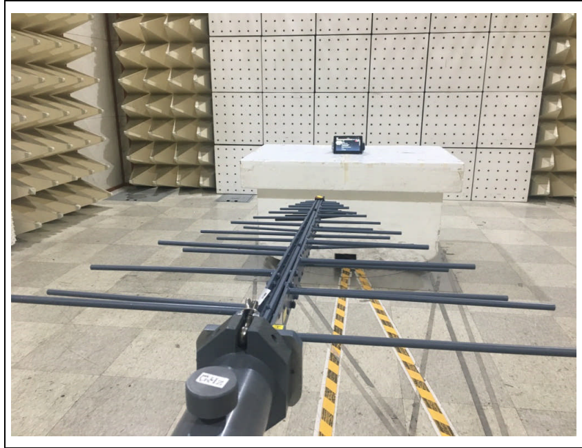
3. Photo of Radiated Spurious Emission Test (Above 1 GHz)