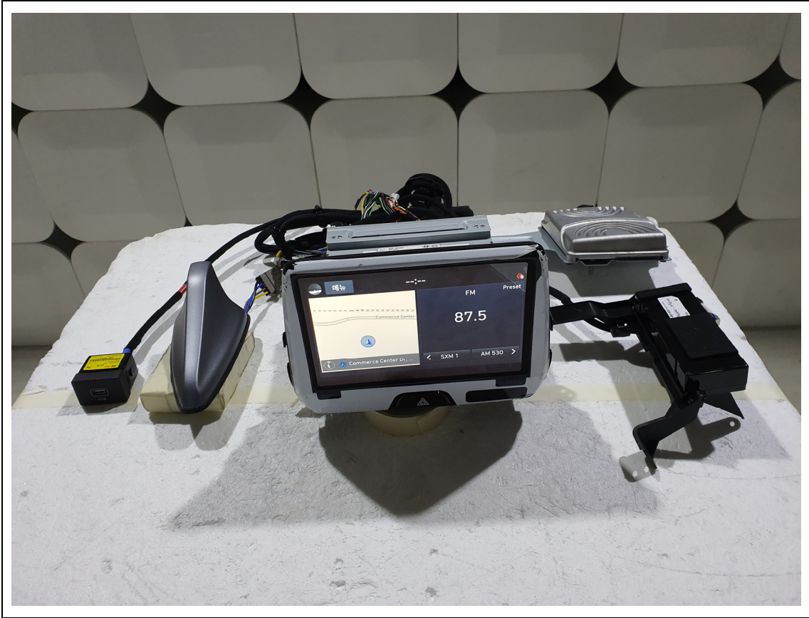
EUT Position: X-axis