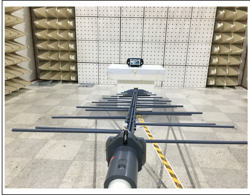
3. Photo of Radiated Spurious Emission Test (Above 1 GHz)