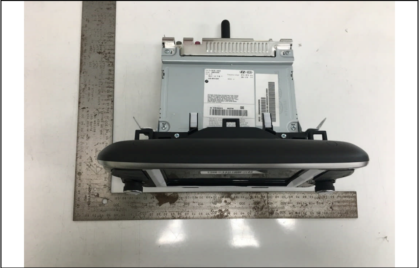
Bottom view of EUT