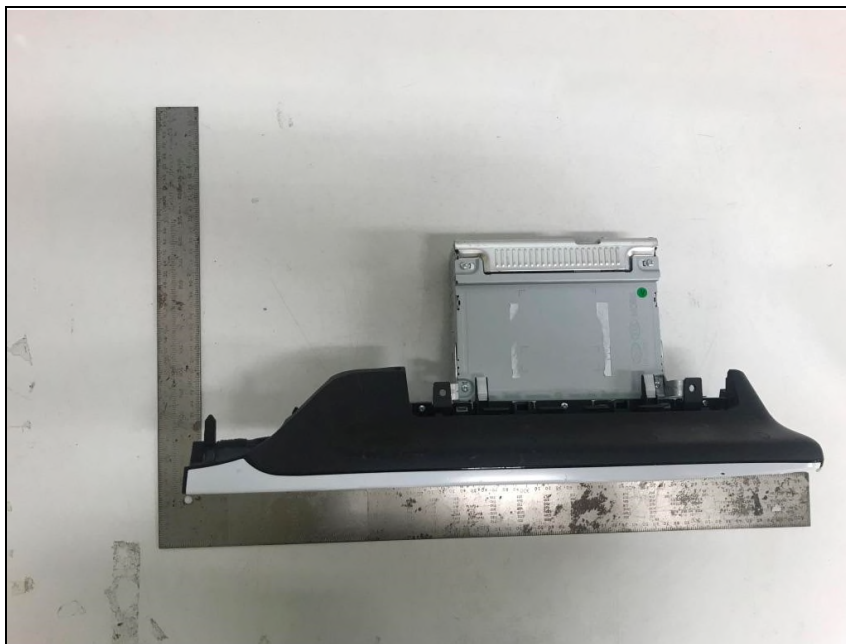
Bottom view of EUT