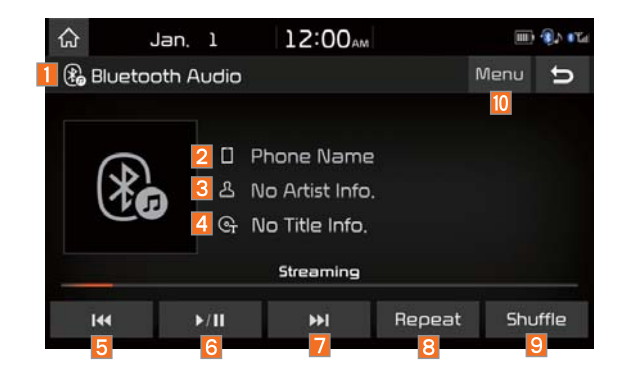
Bluetooth Audio Mode Display Controls