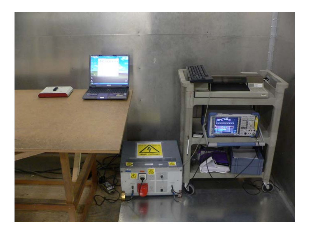
Conducted Emission – Rear View