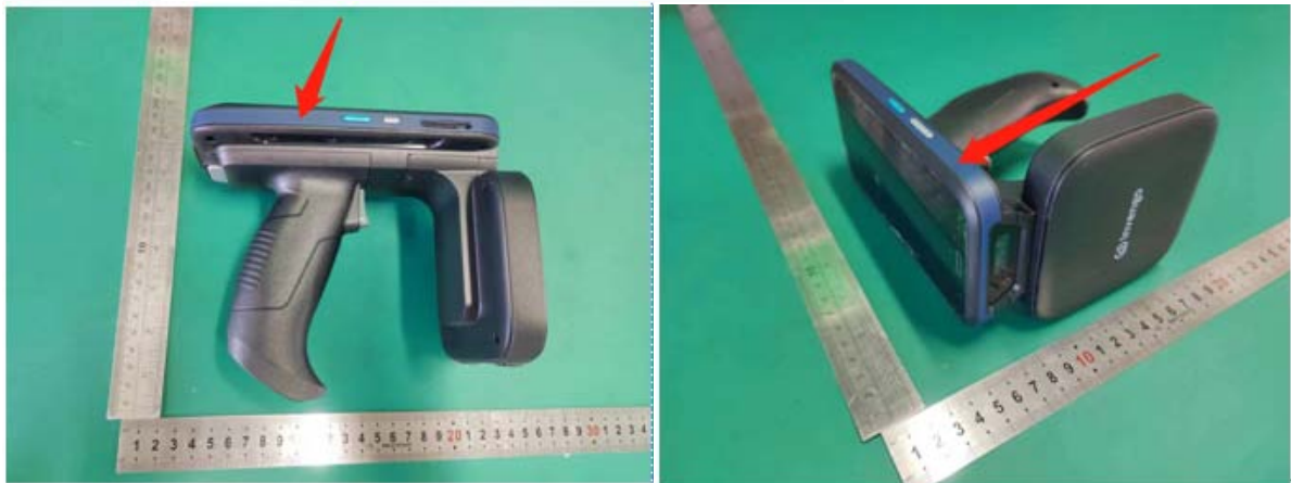
Picture 3: XC2908-G、XC2908-M、XC2908-BM、XC-RH500、XC-BM500、XC9915 , Thick glue front shell, slightly thicker