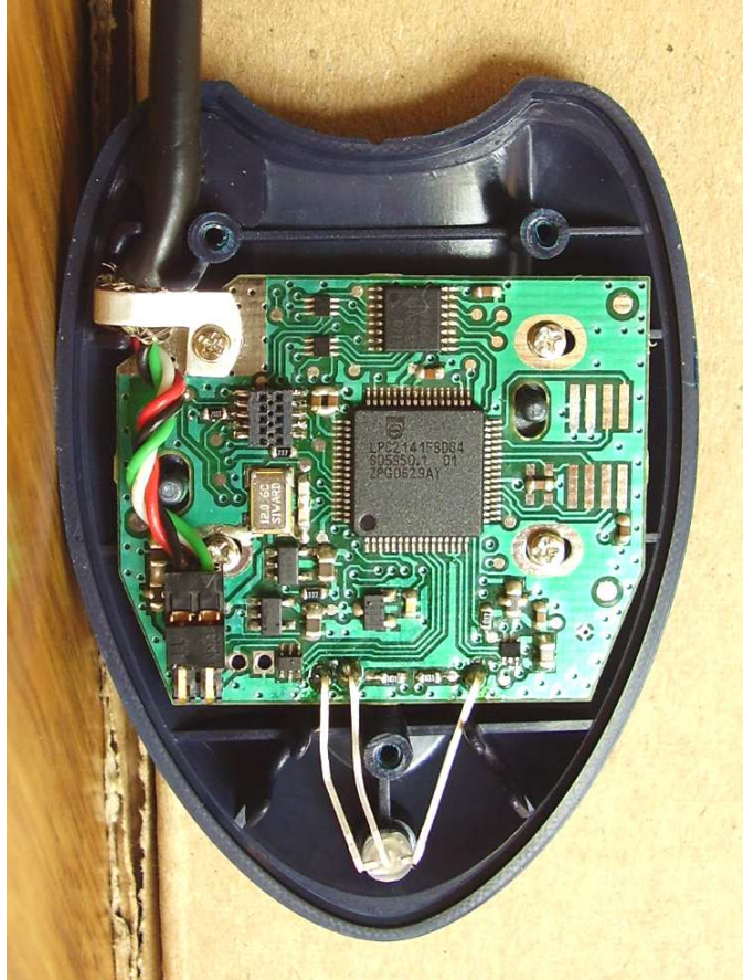
General view, cover opened (upper side)