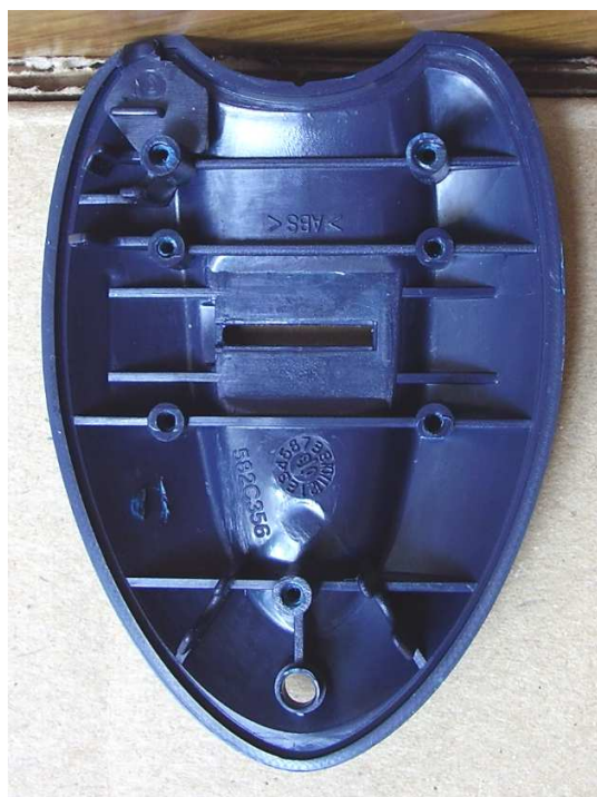
General view, PCB removed (upper side)