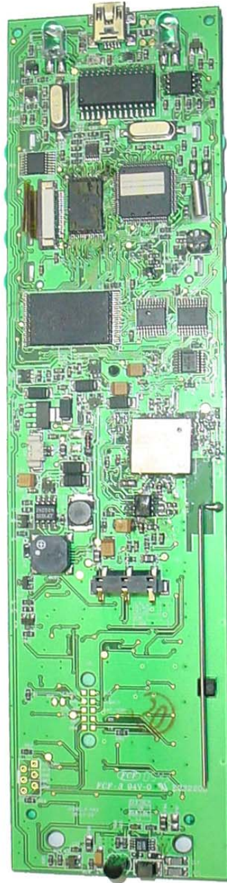
EUT with Rigid Wire Antenna on Remote Control PCB

Logitech Inc. Radio-Z Module, Model L-ZM2102 FCC ID: TOB-LZM2102 IC: 1807E-LZM2102