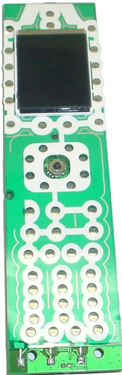
EUT with Rigid Wire Antenna on Remote Control PCB

Logitech Inc. Radio-Z Module, Model L-ZM2102 FCC ID: TOB-LZM2102 IC: 1807E-LZM2102