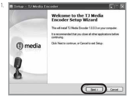
[ 1. Program Setup Start]