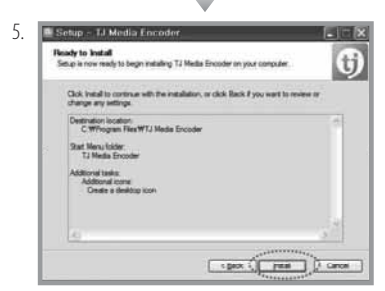
[ 5.Ready to Install]