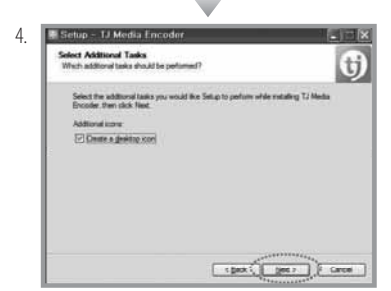
[ 4.Select Additional Tasks ]