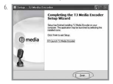
[ 6.Setup Finished ]