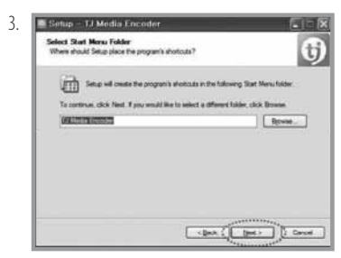
[ 3.Select Start Menu Folder]