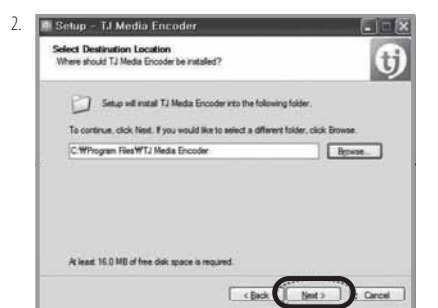
[ 2.Select Destination Location]