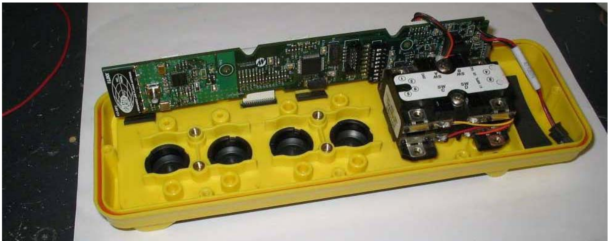
Board installed in Handheld Transmitter, Front View