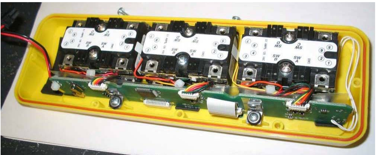
Board installed in Handheld Transmitter, Rear View