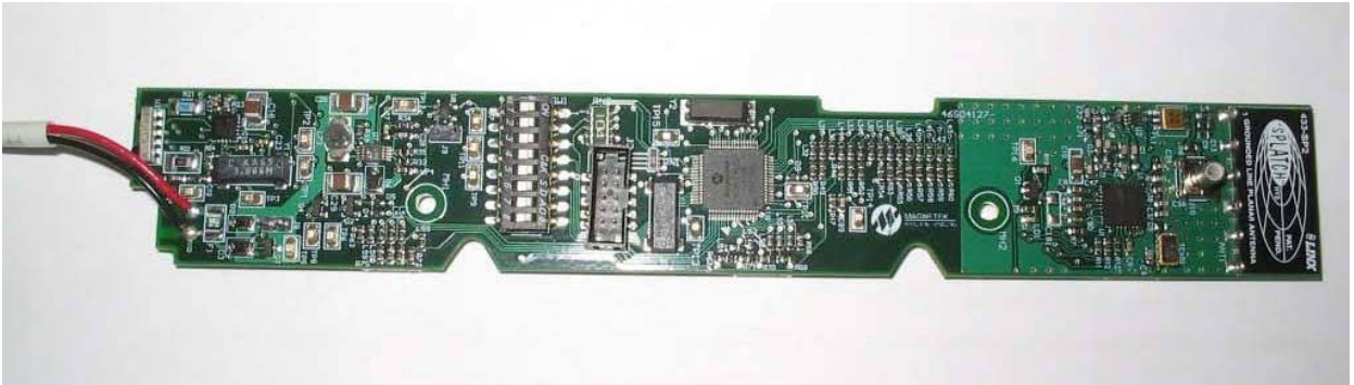
Top of Board