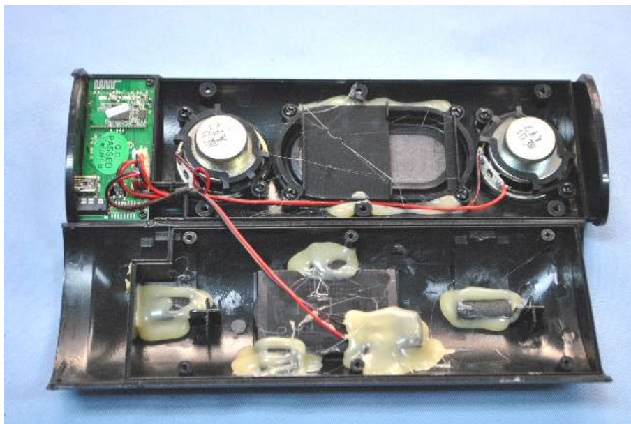
Main & RF board component side