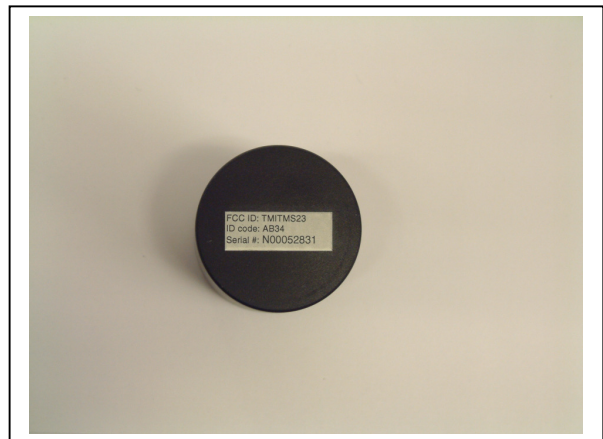
TMS23 showing label position