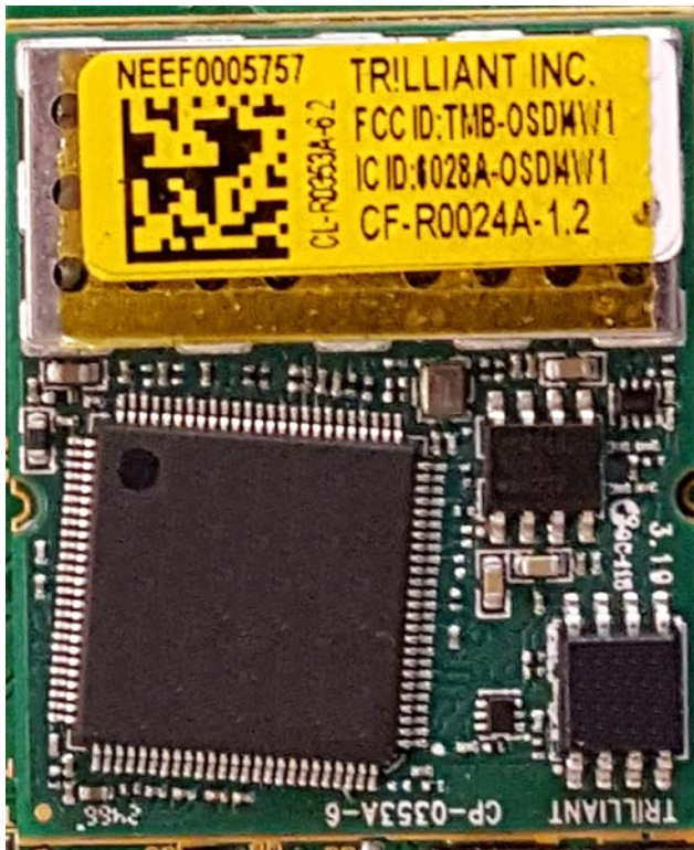
Top (CL-R0353A-6.2) and bottom view (All)