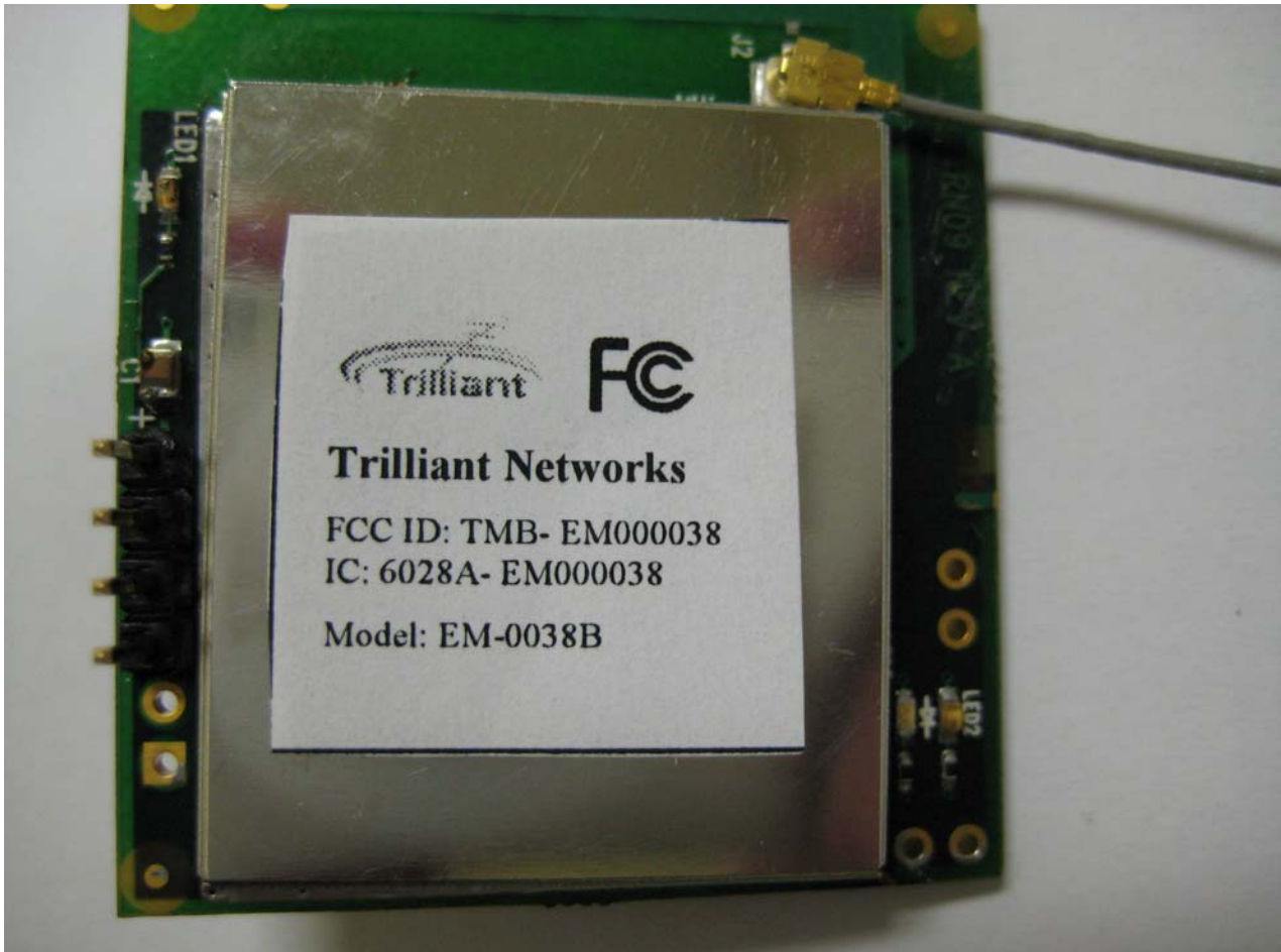
Close-up of ID label Model EM-0038B