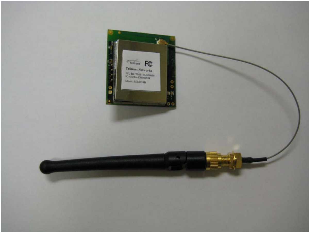
Shielded, with Antenna attached