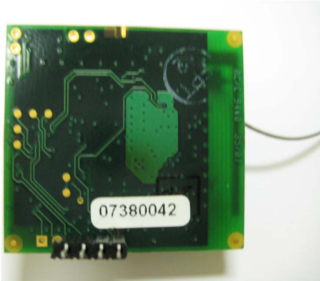
Back Side of Board – View 2