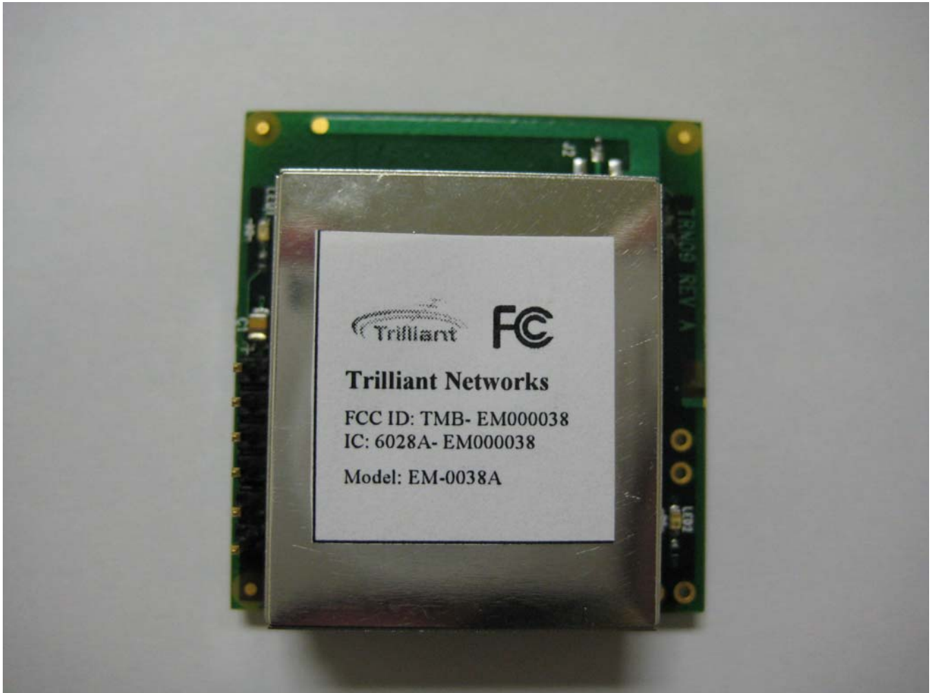
Close-up of ID Label Model EM-0038A