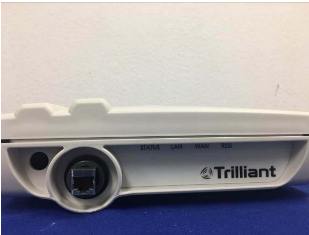
EUT I/O View