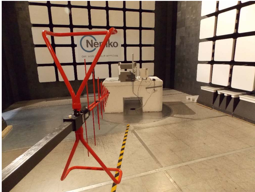
Radiated spurious (out-of-band) emissions setup photo – 30 to 1000 MHz