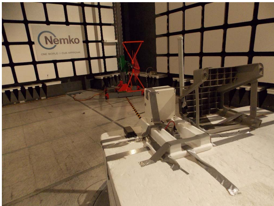
Radiated spurious (out-of-band) emissions setup photo – 30 to 1000 MHz