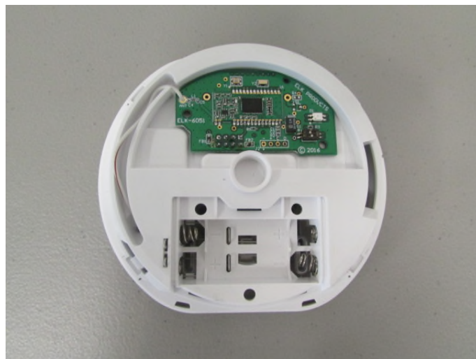
Figure 2: With Battery Cover Removed