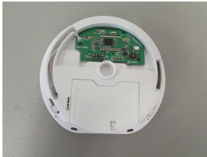
Figure 1: With Battery Cover On