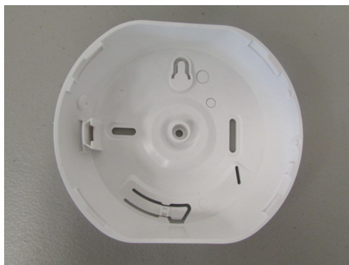
Figure 3: Cover