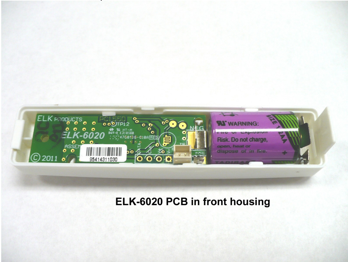
ELK-6020 PCB in front housing