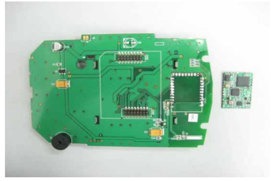
Internal View of EUT – 4(RF Module)