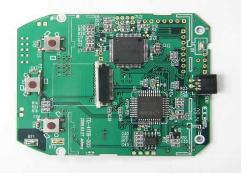
Internal View of EUT – 2