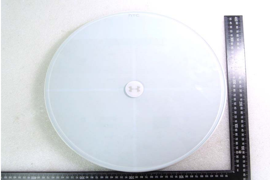
Back View of EUT - 1