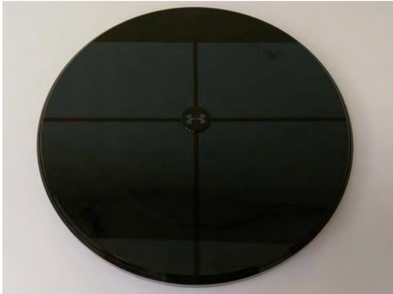
Fig.4 Front view of EUT