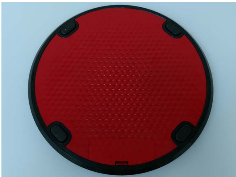
Fig.5 Back view of EUT

Unless otherwise stated the results shown in this test report refer only to the sample(s) tested and such sample(s) are retained for 90 days only. 除非另有說明，此報告結果僅對測試之樣品負責，同時此樣品僅保留90天。本報告未經本公司書面許可，不可部份複製。