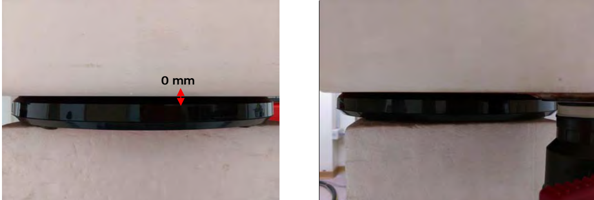
Fig.3 EUT Front side to flat phantom

Unless otherwise stated the results shown in this test report refer only to the sample(s) tested and such sample(s) are retained for 90 days only.