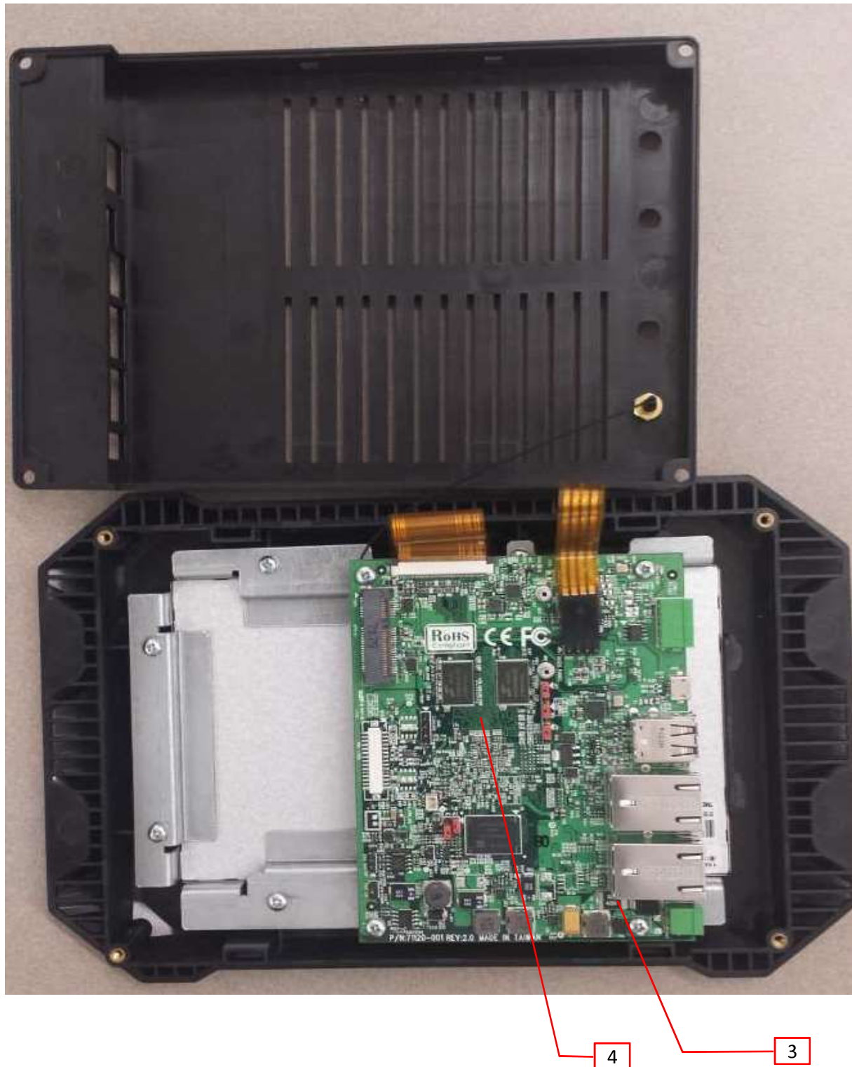
Photo 3 - Internal view