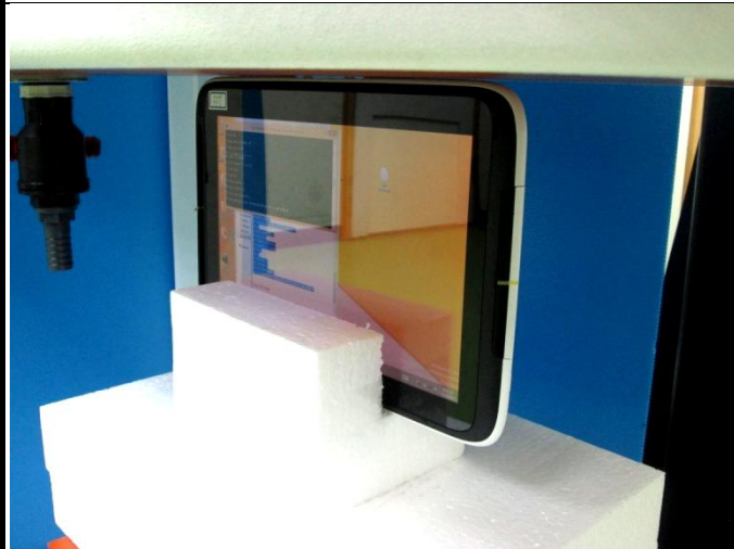
Bottom Side of EUT with 0 cm Gap