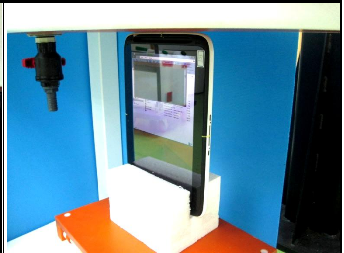
Right Side of EUT with 0 cm Gap