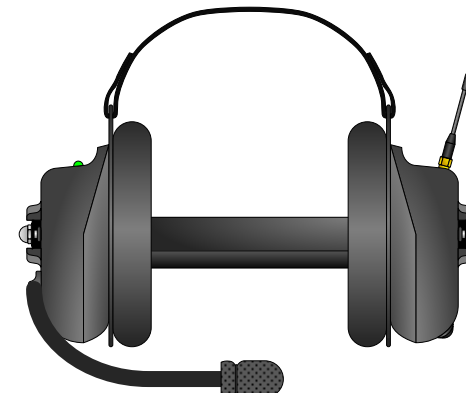
LiberatorMAX Headset FRONT VIEW

3019 Alvin DeVane Blvd. Ste. 560 Austin, TX 78741 Phone: (650) 965-8020