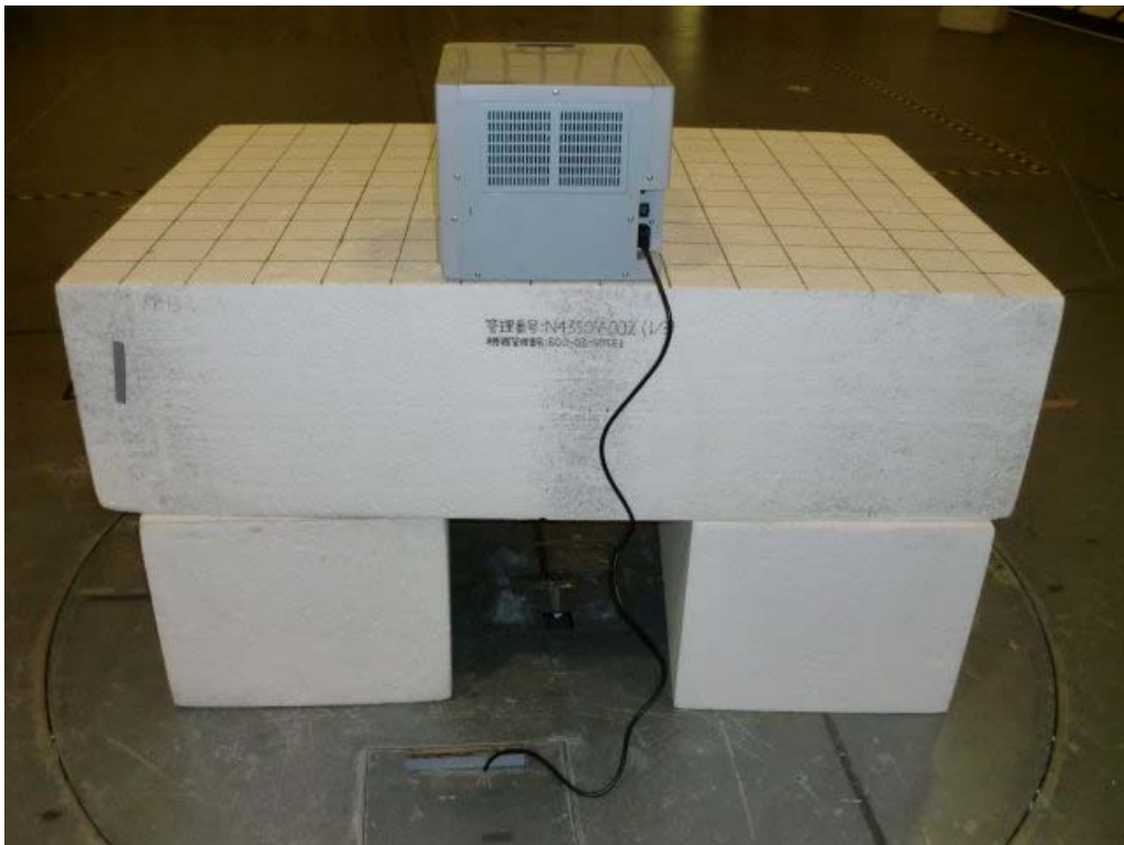
- Rear View -

* The EUT was rotated all axis(X-axis, Y- axis, Z-axis), this photograph present configuration with maximum emission.