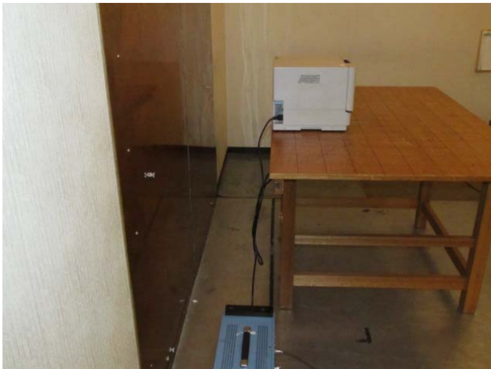
- Side View -

* The EUT was rotated all axis(X-axis, Y- axis, Z-axis), this photograph present configuration with maximum emission.