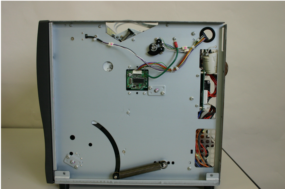
Figure 9.0-9 PHOTO PRINTER CV-01 Internal View- LEFT